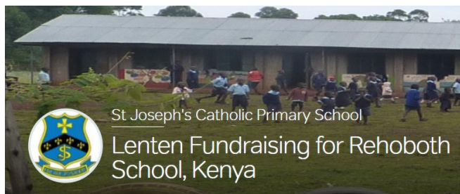
St Joseph's Catholic Primary School